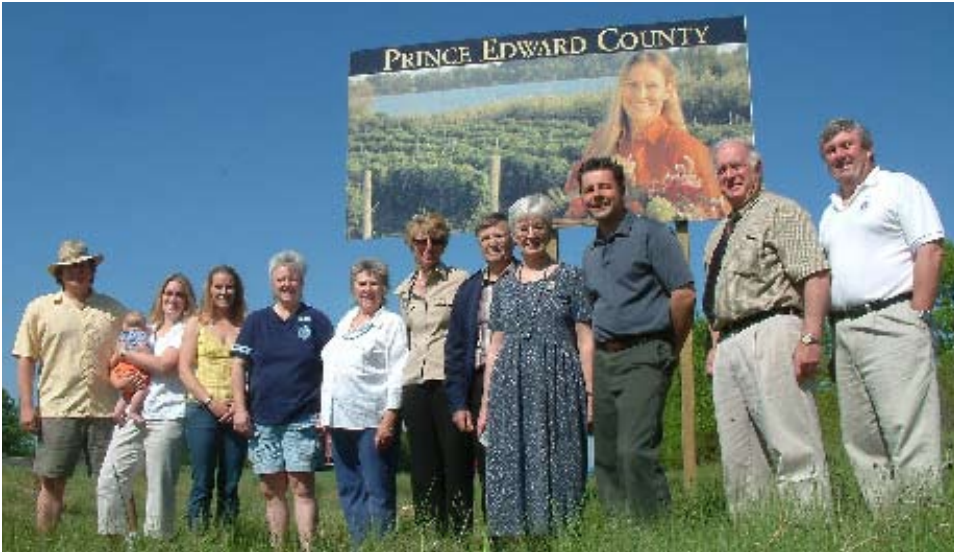
Taste the County staff and partners

WHAT IS TASTE THE COUNTY? Taste the County is the award-winning non-profit, partner-based destination marketing organization (DMO) for Prince Edward County. Its goal: to drive growth by promoting the County experience.